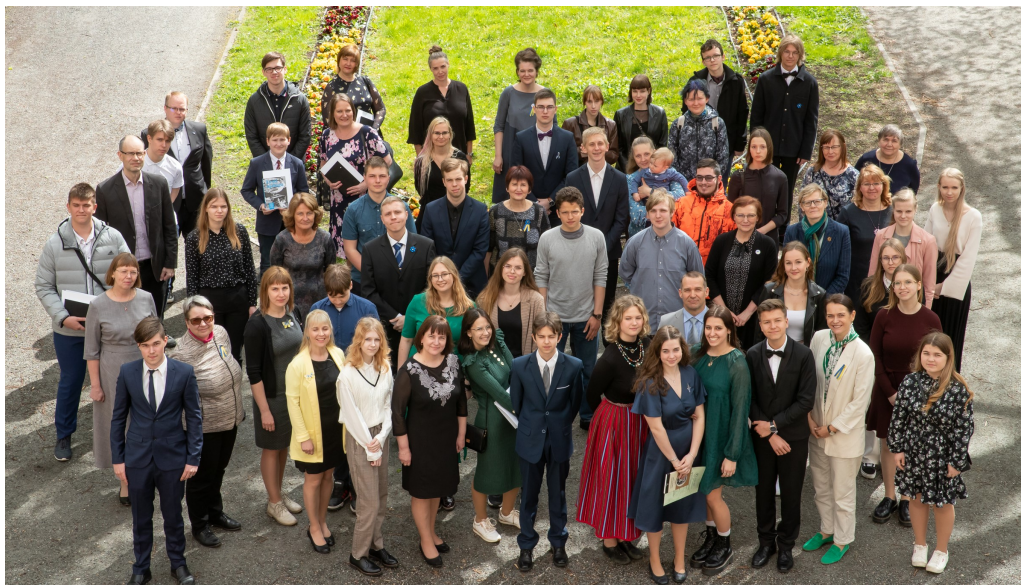
Estonian prize winners at the Ministry of Education and Research in Tartu

This year we can highlight the greater use of materials from historical archives. Various other sources have been used in the research, including family archive data, photographs and correspondence, oral sources, interviews and questionnaires.